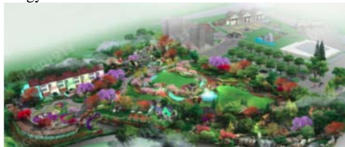
Fig.2 Color colorful garden landscape

The garden landscape has many aesthetic features such as taste, color, shape, etc. It is formed by the combination of various colors through specific beautification effects. Garden landscape is a comprehensive art form. The landscape of the garden landscape is diverse and different in style. The cool color has a quiet and cool feeling, while the warm color gives people a feeling of excitement and warmth [2]. Usage of different colors, methods and means that can create different garden landscapes for creating a unique and wonderful mysterious feeling in the landscape, shown as fig.2. Color as an important part of the landscape design, in the landscape design and the role of the implementation cannot be underestimated, and in its application, according to different functional uses, play a role in guiding the user's psychology.