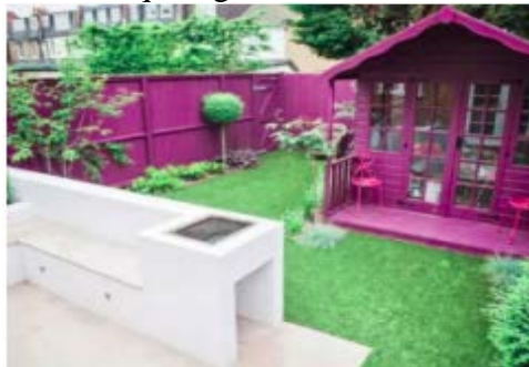
Fig.1 Garden artistic creation

Artistic beauty is an important part of the beauty of garden landscape. Color is one of the important means to create artistic conception, shown as fig.1. It has the function of rendering atmosphere and highlighting the theme, and can achieve the feelings, the scenes, the scenes and the scenes. Effect. For example, different color combinations can express the overall environmental theme of the garden, highlighting the beauty of different themes such as rich, luxurious, noble, simple and elegant. In addition, the air has a perspective relationship, and the use of different colors can enrich the garden landscape and enhance the artistic expression of the garden [2]. For example, for a distant view, in order to zoom in on the visual effect, a contrasting hue of saturated complementary color can be used; and in a space with a small space, using a cool color with a contraction feeling can increase the sense of depth and depth of the space. A cool, quiet garden effect is achieved.